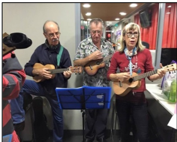
Kempsey Ukulele Group entertaining the crowds

If you would like to make a donation for the purpose of replacing resources, not covered by the Department of Education, for the support unit at Melville High School they can be made to the account outlined below.