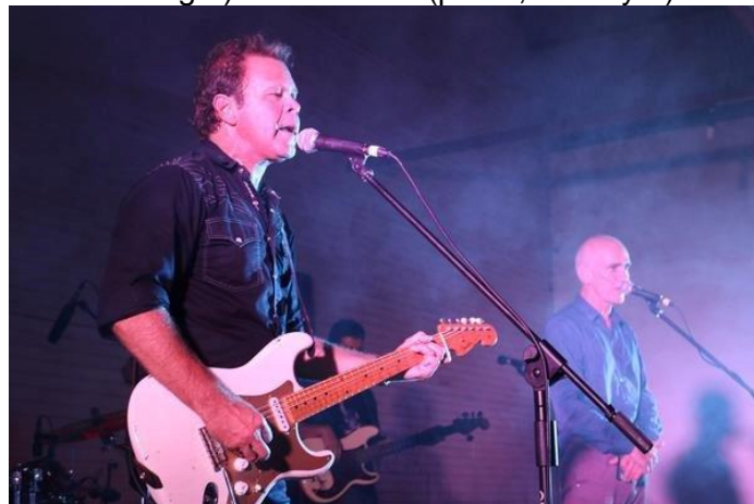
Troy Casser-Dailey and Paul Kelly at Kempsey Freedom Ride concert