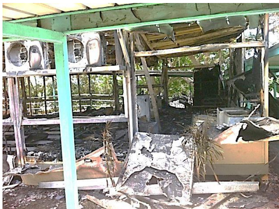
The destruction caused by the fire, to our Support Unit Classroom on Thursday night 29/1/2015