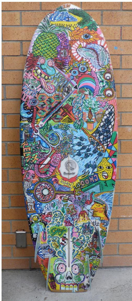
Kyle's board and below close up of the intricate work on the board