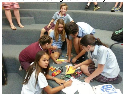
Future Moves problem solving with Year 7 students

Charles Sturt University also assisted our Year 7 students with the Future Moves program ( http://www.csu.edu.au/futuremoves ). Our students once again had a great time. Some Year 10 and Year 11 students have been completing their barista courses with the assistance of TAFE presenters. This provides a fantastic opportunity for the students with options to gain employment in the ever increasing café industry.