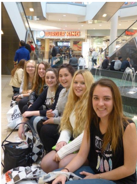
Portrait of the Germany travellers in the local shopping centre in Wetzlar