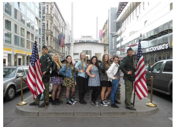
Hamming it up at Checkpoint Charlie.... those guards get a lot of tourists!!!