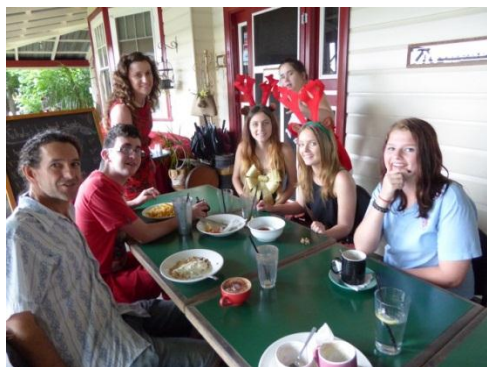
Year 9 and 10 German 2014 at Netherby House.