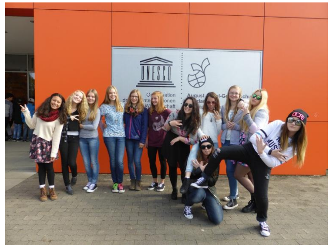
Year 10 girls and their billets at school in Wetzlar Germany.