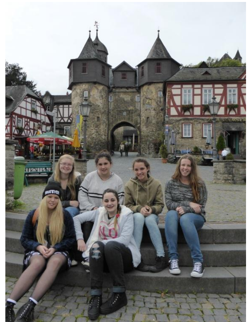
At Braunfels Castle near Wetzlar