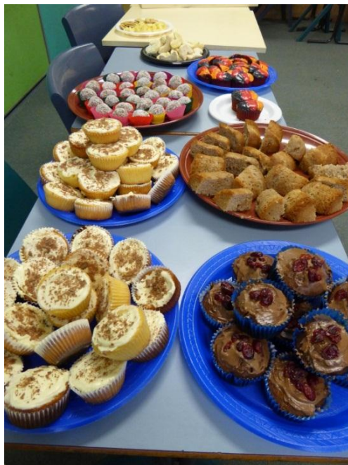
Student prepared German cakes and food ready for the Stehcafe.