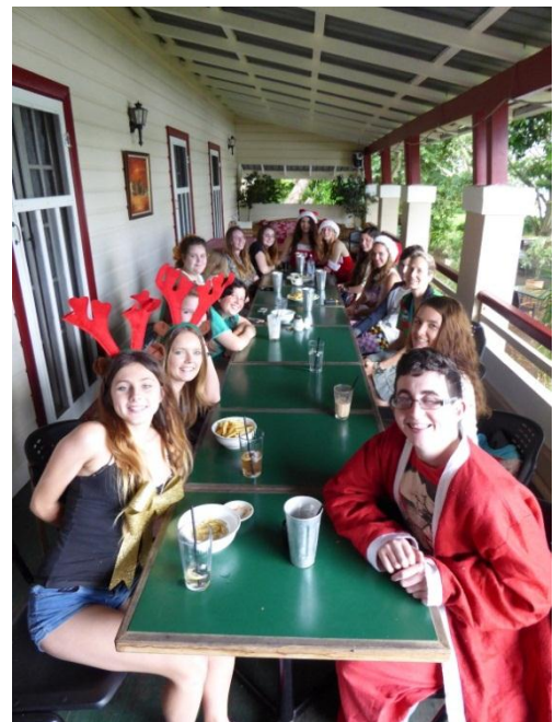
Year 9 and 10 German 2014 at Netherby House.