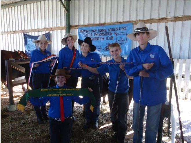
Melville High 'judges' stand proud in their Animal Handling team uniform at Wingham Beef Week.