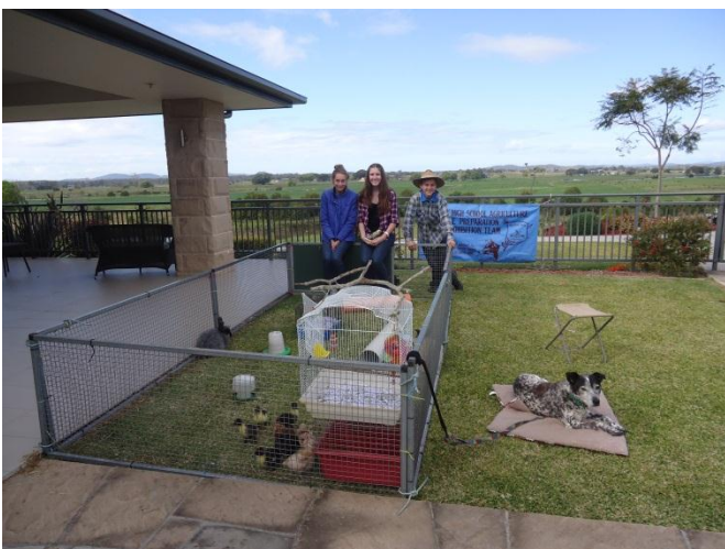
The team displaying their awards and prizes from the Macksville show.